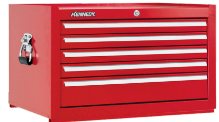
2805X 5 Drawer Chest 29" W x 20" D x 16-1/2" H