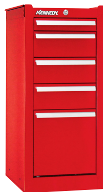
205X 5 Drawer Side Cabinet 13-5/8" W x 20" D x 29" H