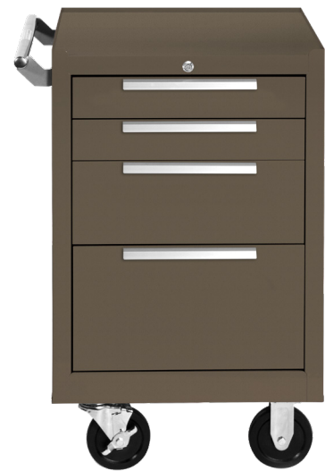
21040X 4 Drawer Cabinet 21" W x 20" D x 35" H