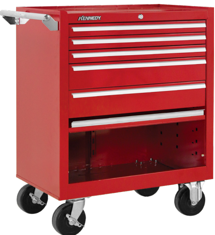
295X 5 Drawer Cabinet 29" W x 20" D x 35" H