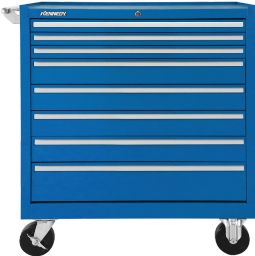
348X 8 Drawer Cabinet 34" W x 20" D x 39" H