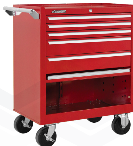
275X 5 Drawer Cabinet 27" W x 18" D x 35" H • Swing down panel