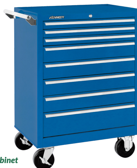
378X 8 Drawer Roller Cabinet 27" W x 18" D x 39" H