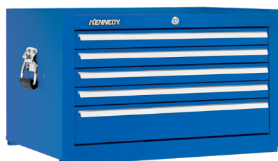
285X 5 Drawer Chest 27" W x 18" D x 16-1/2" H • Fits 27" wide roller cabinet