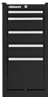
185X 5 Drawer Side Cabinet 13-5/8" W x 18" D x 29" H • Fits 273X, 275X, 277X & 310X • Hangs on either side of the roller cabinet