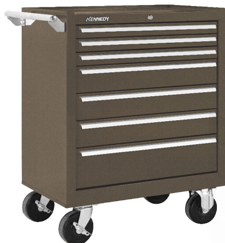
277X 7 Drawer Cabinet 27" W x 18" D x 35" H

K1800 K1800 series is 18" in depth and allows for storage in tight spaces.