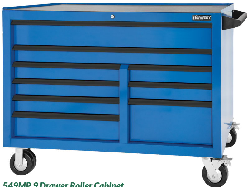
549MP 9 Drawer Roller Cabinet

53-1/2" W x 25" D x 41" H / Net Wt. 430 lbs