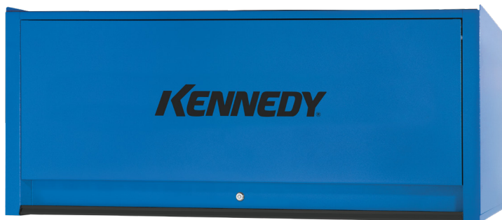
540MP Hutch / Canopy

53-1/2" W x 24-9/10" D x 24" H / Net Wt. 135lbs