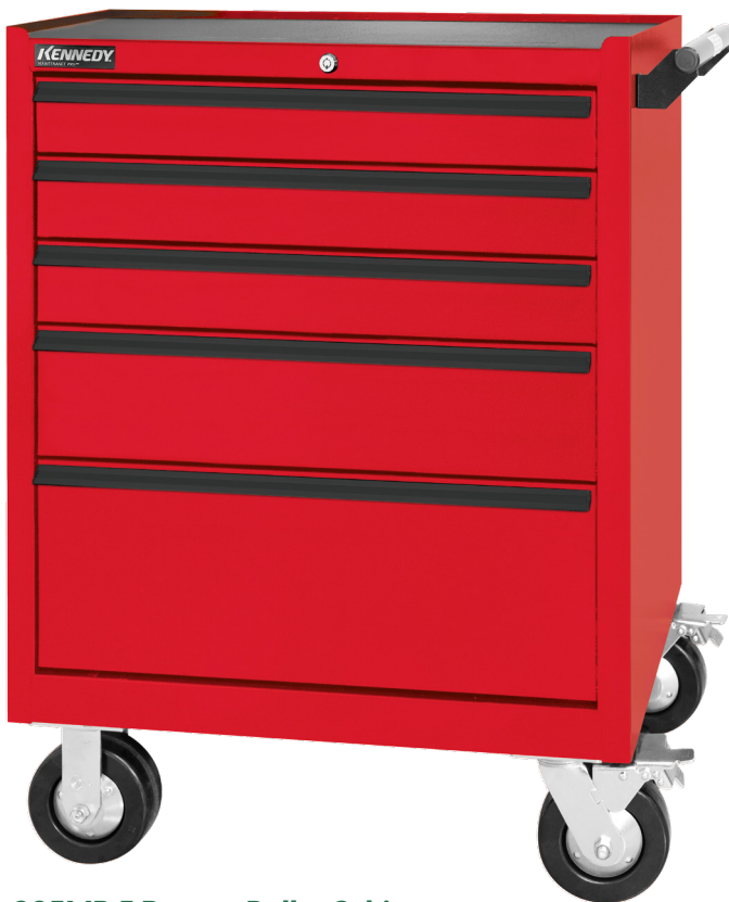
295MP 5 Drawer Roller Cabinet