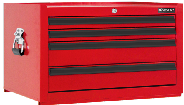
2904MP 4 Drawer Top Chest

29" W x 20" D x 16-1/2" H / Net Wt. 87 lbs