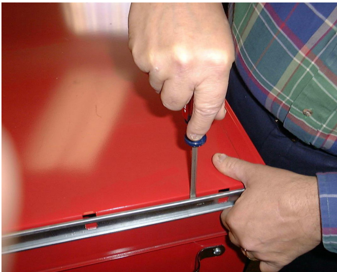
Steps 1 and 2