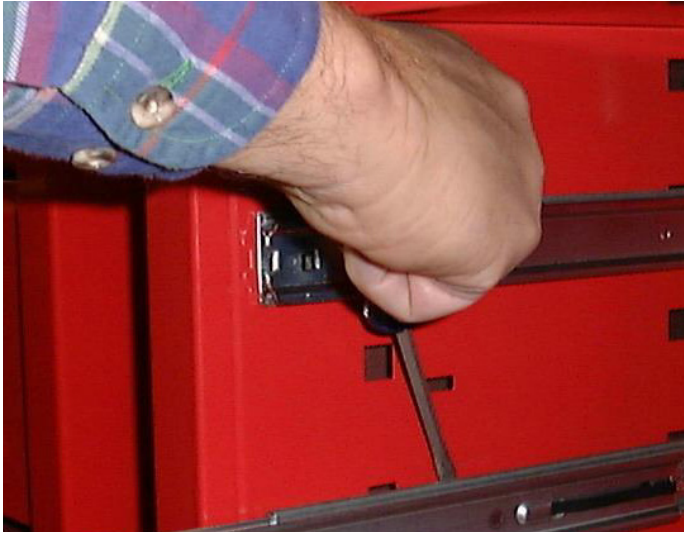
Steps 1, 2 and 3