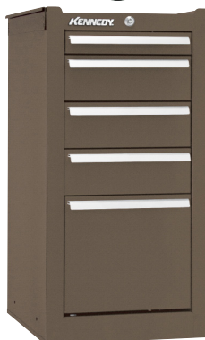
205X 5 Drawer Side Cabinet 13-5/8" W x 20" D x 29" H