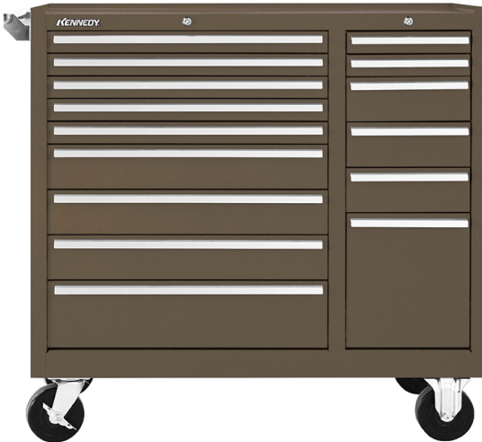
315X 15 Drawer Cabinet 40" W x 18" D x 39" H