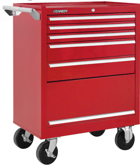
295X 5 Drawer Cabinet 29" W x 20" D x 35" H