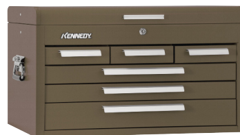
266 6 Drawer Chest 26" W x 12" D x 14" H • Fits 27" & 29" roller cabinets • Lift out tray with socket set divider