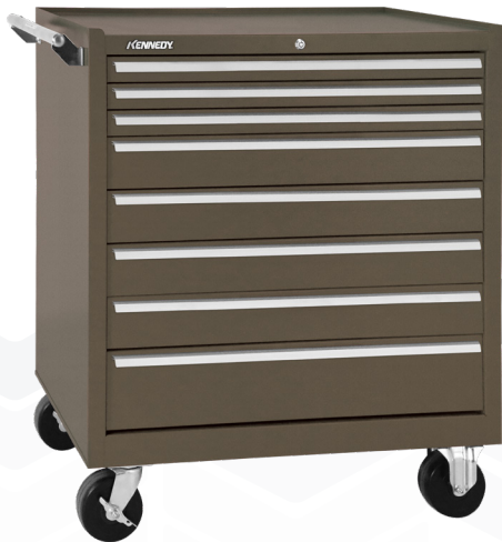
348X 8 Drawer Cabinet 34" W x 20" D x 40" H

DURABILITY COMES STANDARD SO YOU GET DEMANDING JOBS DONE TIME AND TIME AGAIN. INCREASE PRODUCTIVITY. GET THE JOB DONE.