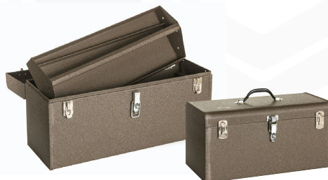
K20 Professional Tool Box 20" W x 8" D x 9" H • Lift out tray with socket set divider