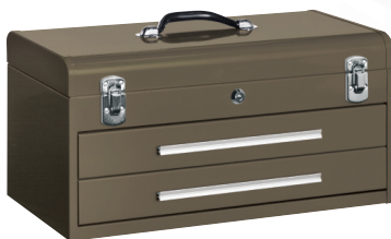
220 2 Drawer Portable Chest 20" W x 8" D x 9" H