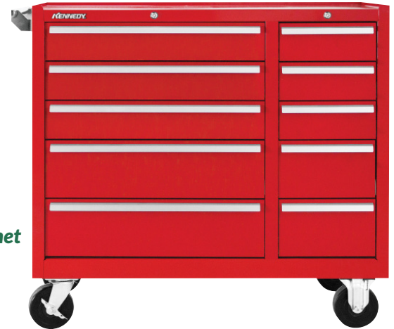
310X 10 Drawer Cabinet 40" W x 18" D x 39" H