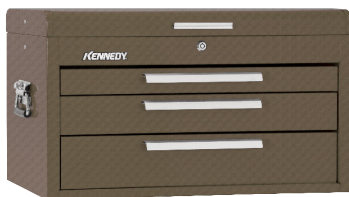
263 3 Drawer Chest 26" W x 12" D x 14" H • Fits 27" & 29" roller cabinets • Lift out tray with socket set divider