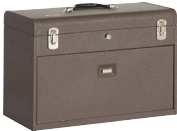
Drop Front Panel for Added Security