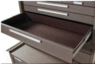
Wool-lined drawers protect precision tools