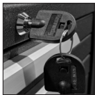
High security tubular locking system