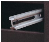
Two-Piece, Welded Friction Drawer Slides