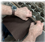
Every drawer is felt lined by hand (Machinist's Chests)