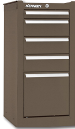
185X / 205X 5-Drawer Side Cabinet • 185X Fits models 273X, 275X, 277X, 310X • 205X Fits models 295X, 297X, 348X • Hangs on either side of rolling cabinet • Ball bearing drawer slides