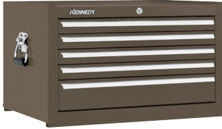
285X 5-Drawer Chest • Rubber Cushioned Sides Handles • Ball Bearing Slides