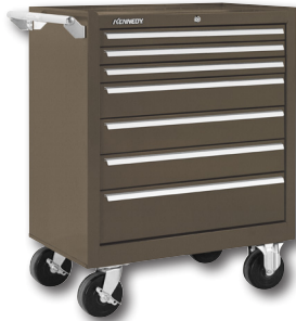
277X 7-Drawer Cabinet