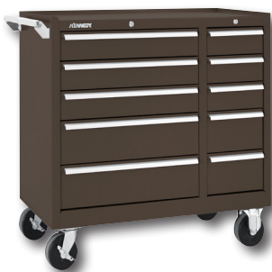
310X 10-Drawer Cabinet