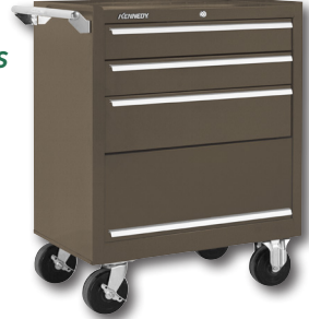
273X 3-Drawer Cabinet