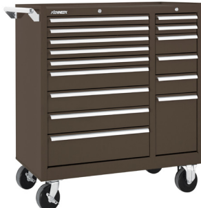
315X 15-Drawer Cabinet