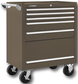
275X 5-Drawer Cabinet