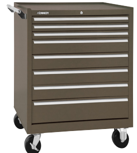
348X 8-Drawer Cabinet