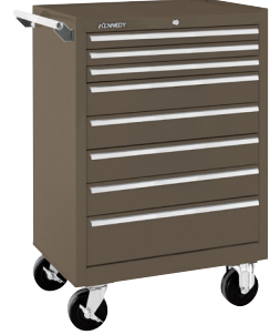
378X 8-Drawer Cabinet