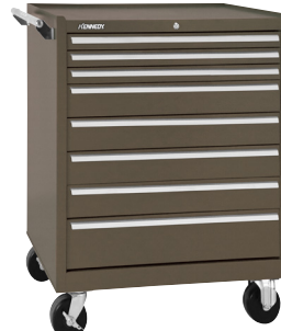
348X 8-Drawer Cabinet