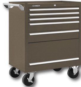
295X 5-Drawer Cabinet