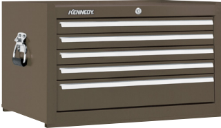
285X 5-Drawer Chest • Rubber Cushioned Sides Handles • Ball Bearing Slides