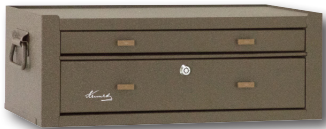
MC22 / MC28